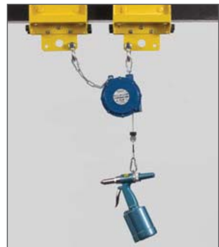
Portable Tool Support Applications