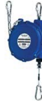
AB and ABRL Model, Front View