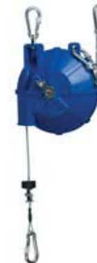
AB Model, Rear View