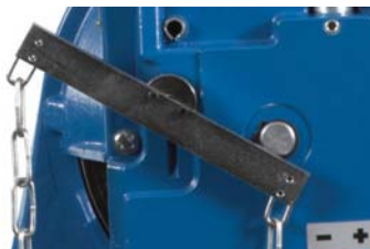
Remote Lock Cam and Lever attached to Chains

Handle chain length can be adjusted to match unit installation height