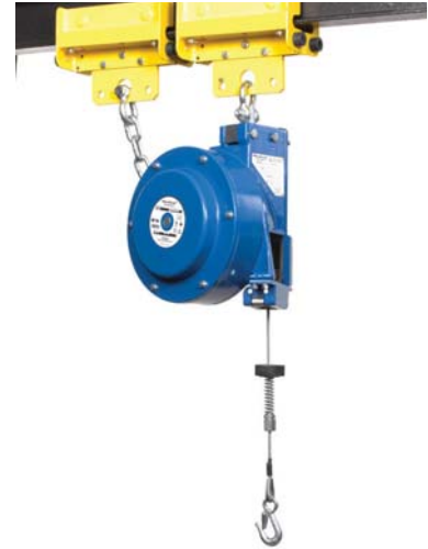
KA Model Balancer and Trolley Application