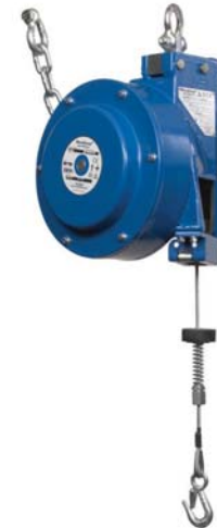
KA Model Balancer with Cable Arrest

Dimensions for Reference Only [ \pm 10\% ]. Subject to change without notice.