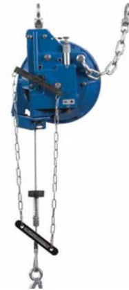
KA Model Balancer with Remote Lock Feature operated by handle and chain