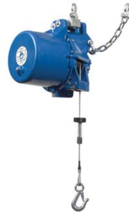
LA Model - Front View