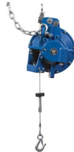
LA Model - Rear View