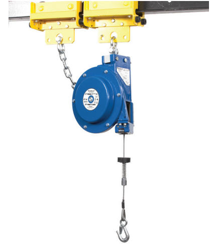
JA Model Balancer and Trolley Application