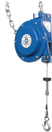
JA Model Balancer