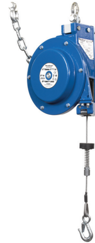
JA Model Balancer with Cable Arrest

Dimensions for Reference Only [ \pm 10\% ]. Subject to change without notice.