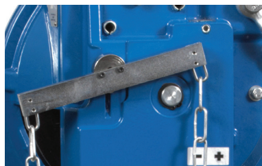
Remote Lock Cam and Lever attached to Chains

Handle chain length can be adjusted to match unit installation height