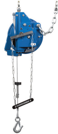
JA Model Balancer with Remote Lock operated by handle and chain