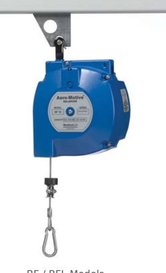
BF / BFL Models